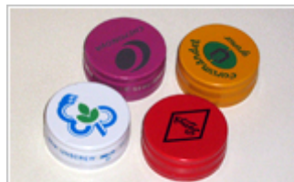
Closures - 38 mm