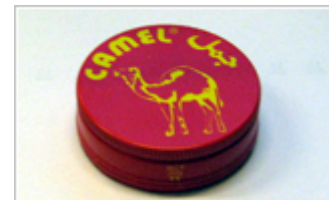
Closures - 53 mm

Tin Containers and Closures has a wider application in the following industry: