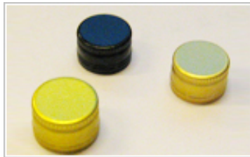
Closures - 20-22 mm

ROPP (Roll on Pilfer Proof) Closures made of high quality aluminium which are internationally accepted sealing devices, fitted on glass, plastic and metal containers for prevention of pilferage. A simple twist breaks the pilfer proof seal, assuring the consumer of the purity of the sealed product. Refixing the closure after part consumption of the product ensures that the contents are secured and do not deteriorate or evaporate fast.