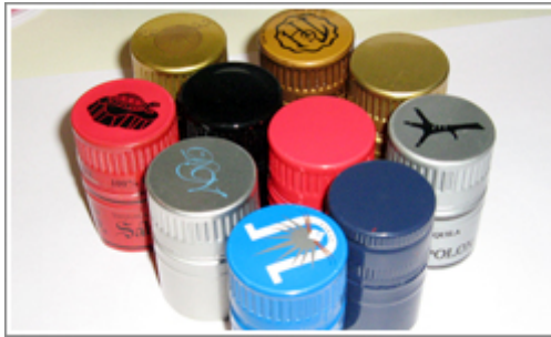
Deep Drawn Closures