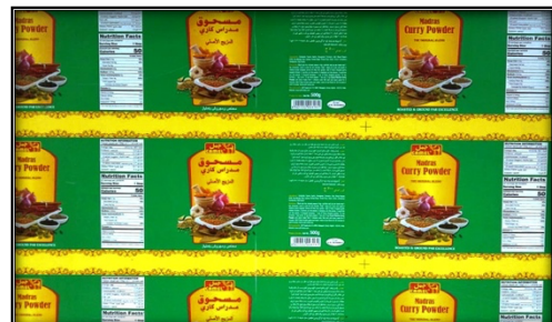
Printed Tin Sheets