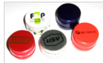
Closures - 28 mm