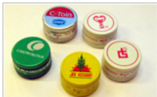
Closures - 31.5 mm