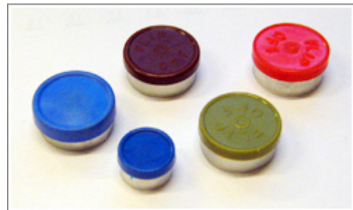
Flip off Seals

Seals are available in plain colours or printed with your company's monogram or any short of message.