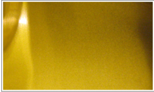
Aluminium Sheets – Coated