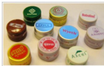
Closures - 25 mm